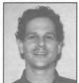
Richard Cohn Outstanding Publication Award