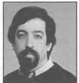
Leslie David Blasius Young Scholar Award