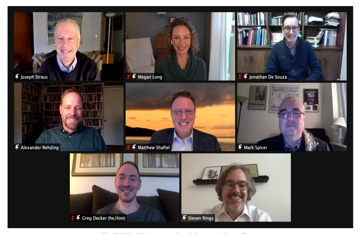
The 2020 Publication Awards recipients together on Zoom.